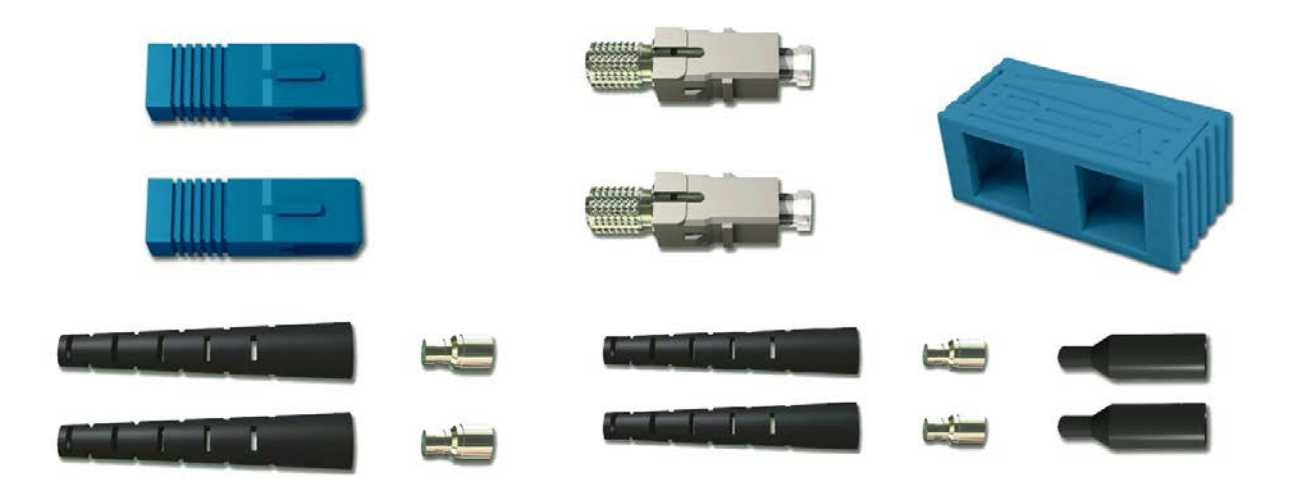
P/N: 48SMCSCD SC UPC duplex connector, suitable for OS1, OS2 & G657

UPC SC duplex singlemode connector for 900µm/2mm/3mm cables