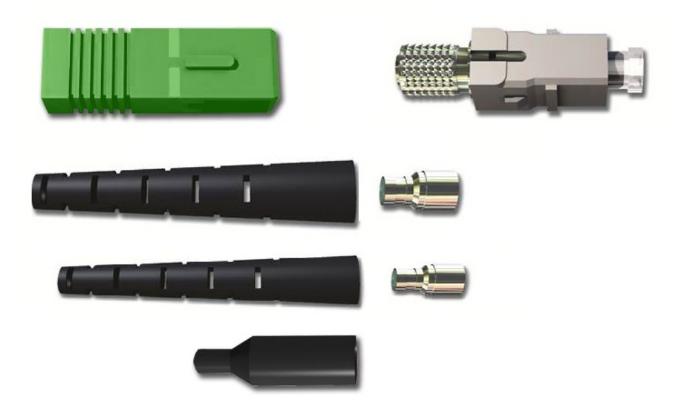
P/N: 48SMCSCAS SC APC 8° simplex connector, suitable for OS1, OS2

APC SC simplex singlemode connector for 900µm/2mm/3mm cables