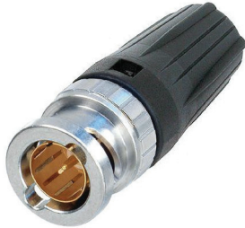
Neutrik BNC NBNC75BXU13