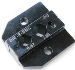
Neutrik crimping tool : DIER BNC PU