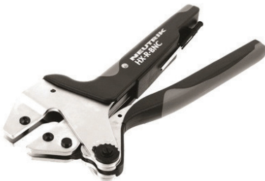
Neutrik crimp tool : HXR BNC