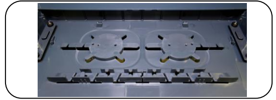
Internal management with integrated routing rings