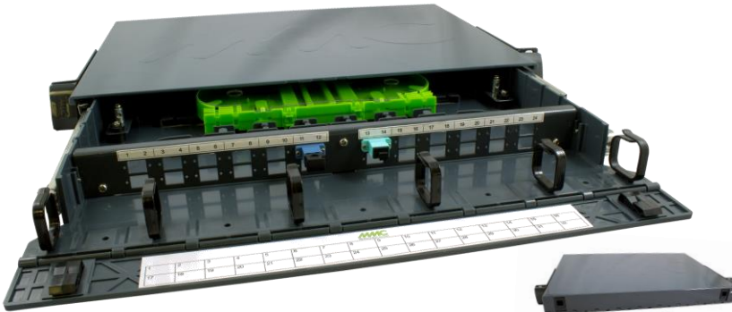
P/N: TT 1U 24 SCS LCD Shown open

“TT Panel” - 19” Telescopic fiber optic patch panel 1U