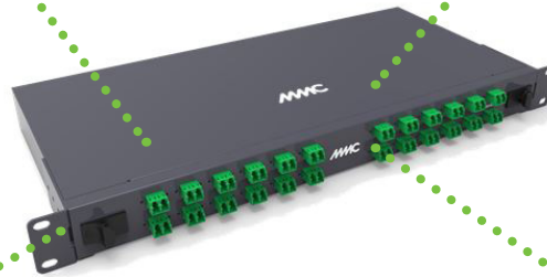
P/N : TC 1U 24A LCAD MONO