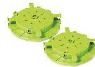
Optional: Routing management 48SPOOLERKIT