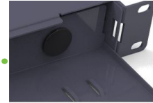
Dust proof cable glands entry