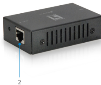
2. RJ-45 PoE Out