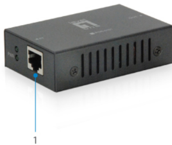
1. RJ-45 PoE In

For system integrators looking for a professional solution to help extend their PoE network, POR-0101 is the perfect accessory to increase your Power over Ethernet network performance. LevelOne POR-0101, a 1-Port PoE Repeater requiring neither configuration nor electrical power, is an innovative transmitter to pass on both data and power extend to another 100 meters. The delivery through one PoE port and one non-PoE port are adequate to extend network devices such as WLAN Access Points, Network Cameras and other appliances with high-speed to the network for greater deployment flexibility.