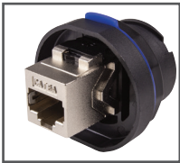
I4COUPL6AIP68 CAT6A coupler shielded IP68