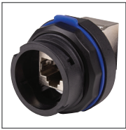
I46AFSIP68 CAT6A RJ45 connector shielded IP68