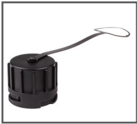
I4CAPPLUG Sealing cap for RJ45 plug