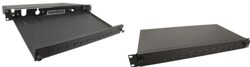
Patch panel, shown open and closed

Cost effective optical sliding patch panel 19" 1U