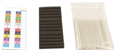
Content of the E48MKBTO kit