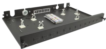
ETO1U12SCDLCQ Patch panel ready for splicing

Cost effective self-adhesive splice bridge for 12 or 24 heatshrinks