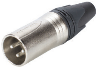
XLR 3 et 5 point