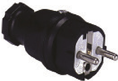
Power plug 16 A