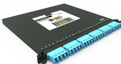
DCK706ALCQOM3 (DC FANOUT KIT not included)