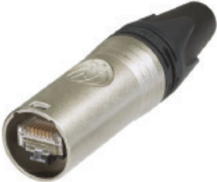
Neutrik Ethercon : NE8MX6