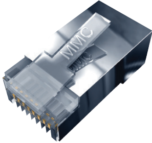
Shielded PLUG RJ45 : MMCRJ45SC6SI